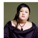
Matsuko Deluxe Columnist